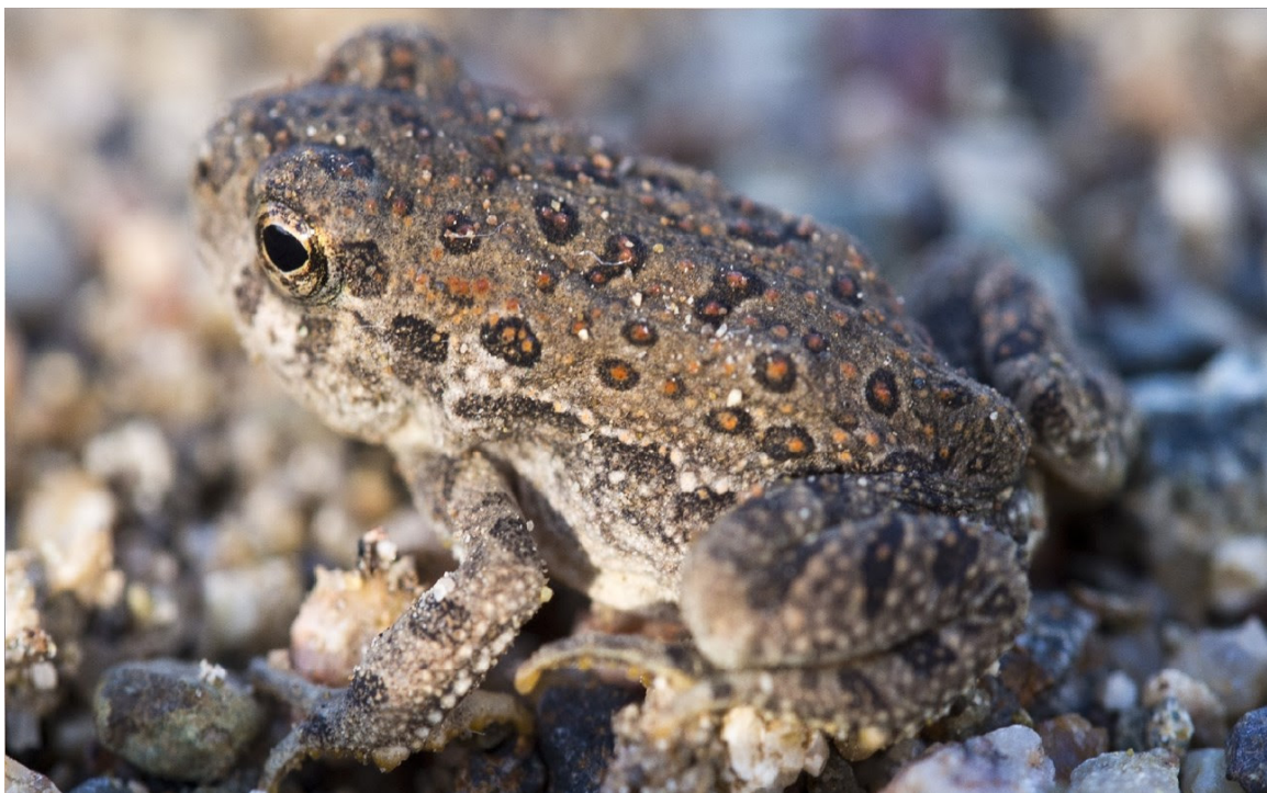
Red-Spotted-Toad