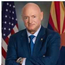
Mark Kelly (i)

Senator Kelly is a strong advocate for action on the climate crisis, environmental justice, and clean air and water. While serving the past two years in the U.S. Senate, he has voted to appoint competent leaders to key agencies that manage our public lands, and protect air, water, and wildlife. He voted to support the Inflation Reduction Act which included clean energy