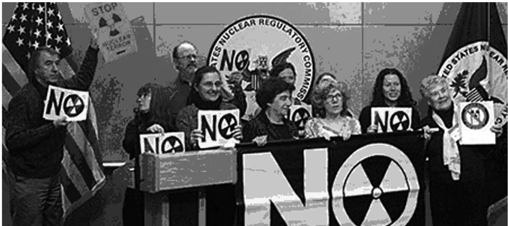
Sierra and partners testify at NRC Hearing-over 250 attended.