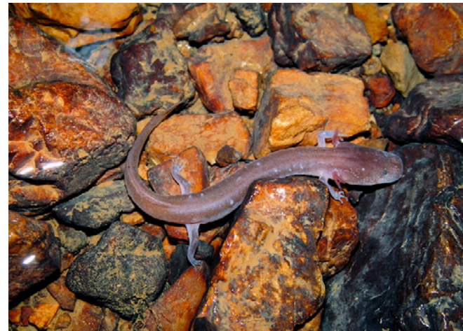
The endangered Berry Cave salamander.

Armed with the research of these experts, in 2003 I petitioned the US Fish and Wildlife Service (USFWS) to add Gyrinophilus gulolineatus to the federal endangered species list. In response I was told that to list the salamander, the USFWS would first have to conduct a study to determine whether listing was justified and then create and implement a habitat protection plan. But these processes cost both money and staff time, and, given tight budgets, they would likely be postponed indefinitely.