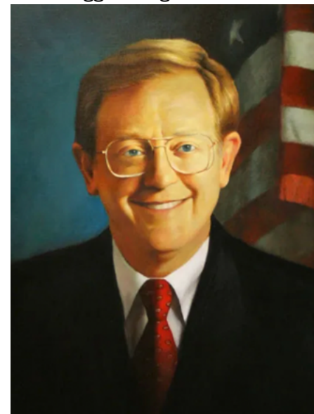
Knoxville's portrait of Victor Ashe who served as mayor from 1987 to 2004

In the face of these obstacles and, later, the firm opposition of Madeline Rogero, who became mayor in 2011, the Tennessee Department of Transportation ultimately dropped its plan to complete the Parkway. There are still people who would like to complete it, and new proposals to do so emerge from time to time, but the growing acclaim and popularity of the Urban Wilderness render this increasingly improbable.