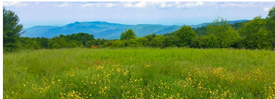
Whigg Meadow.

A National Scenic Trail designation would help ensure the preservation of the timeless beauty of the trail's corridor. The status would augment the BMT's already high value as a popular recreation destination for hikers as