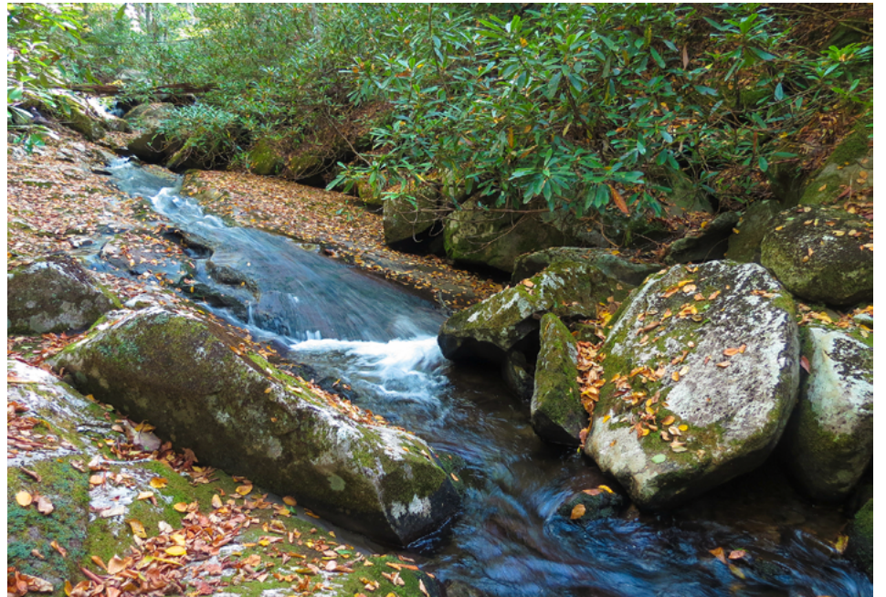
Benton Creek on the Benton MacKaye Trail.

well as increase the trail's positive economic impact on local communities. It also would release additional USFS and NPS resources to help the Benton MacKaye Trail Association fulfill its mission to preserve, protect and maintain the trail corridor.