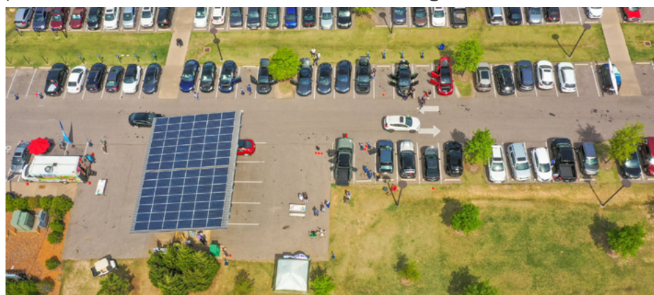
Memphis' Shelby Farms Park was the location of Electric Earth Day on Memphis' Shelby Farms Park Saturday, April 23, Event.

Notwithstanding significant competition from the Memphis International Auto Show, back from a two-year hiatus, the energy-aware and the environmentally committed showed up at our DEED event to learn more about the impact of hybrid and battery electric vehicles' twin impacts on energy production and the reduction of environmental degradation.