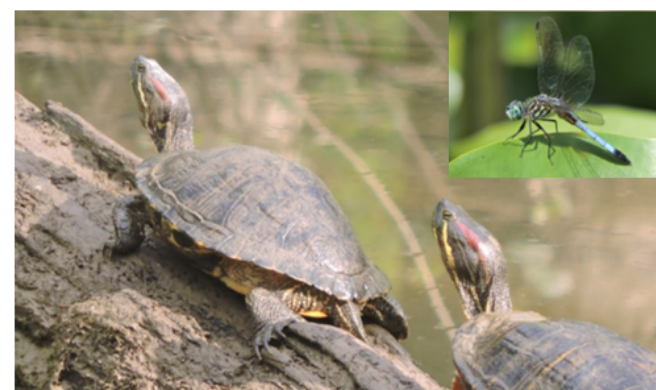
One project on iNaturalist, “Tracking Red-Eared Sliders” maps the distribution of introduced Red-eared Sliders ( Trachemys scripta elegans ) observed across the world. Other projects have been designed to monitor spiderweb designs, natural bioluminescence, the effects of climate change on a region’s birds, and even a study involving color variation in the wings of Blue Dasher ( Pachydiplax longipennis ) dragonflies, which was published two years ago by a graduate student.

Overview 1,195 OBSERVATIONS 461 SPECIES 232 IDENTIFIERS 37 OBSERVERS Stats