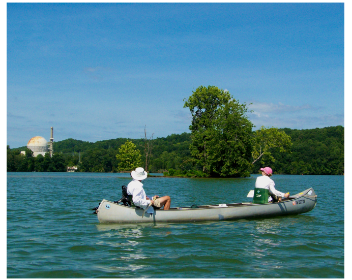
Boaters on Melton Hill Lake checking out the Oak Ridge National Laboratory reactor dome.