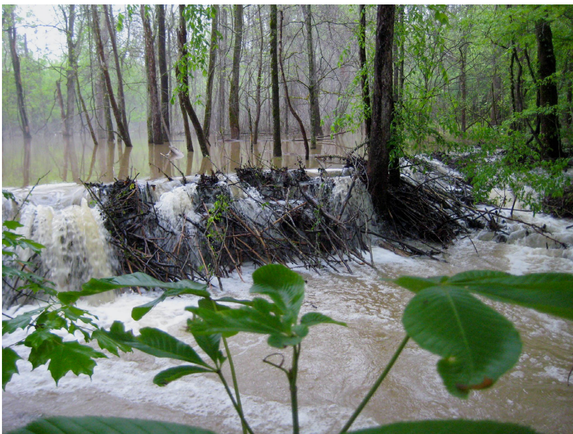
A beaver dam under stress from a heavy rain in the Black Oak Ridge Reserve. Oak Ridge, TN.

Contact Virginia at virginia.dale4@gmail.com and Ellen at ellen@ellensmith.org