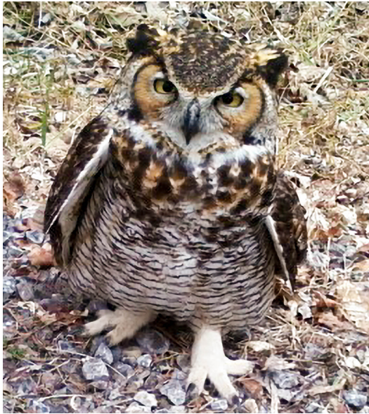
A fledging great horned owl in the Black Oak Ridge Conservation Easement (2011).