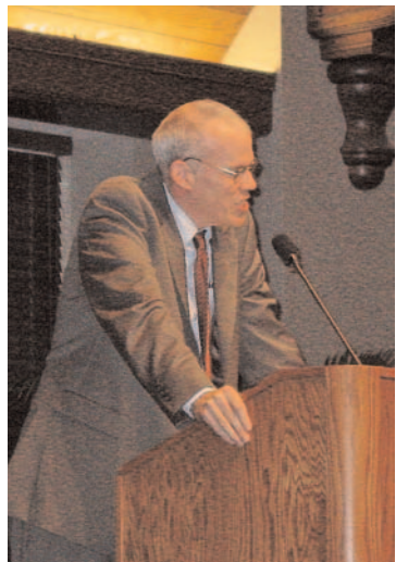
Bill McKibben spoke at Rhodes College in Memphis.

Global warming is McKibben's big concern. In his talk, he cited statistics about the problem, but focused most on his solutions. We humans have to make ourselves "smaller", he said. He explained that by "smaller" he meant that we must use fewer natural resources, and stop thinking of ourselves as the center of all creation. Technology has a part to play in the solution, but the key is to find a sense of greater community that will enable us to live together and in harmony with nature. As far back as 1989 he was saying, "...we've grown about as powerful as it's wise to grow".