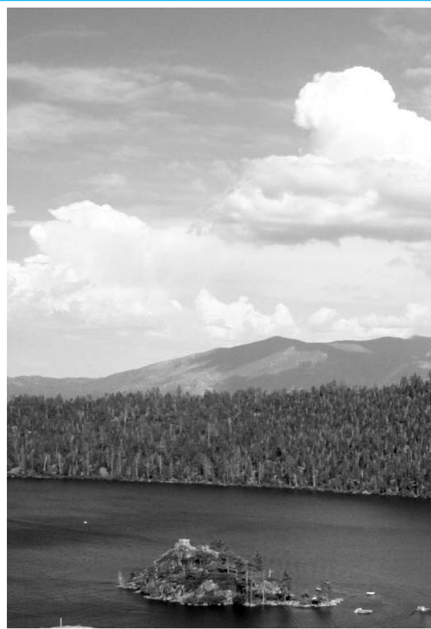
Emerald Bay, Lake Tahoe.