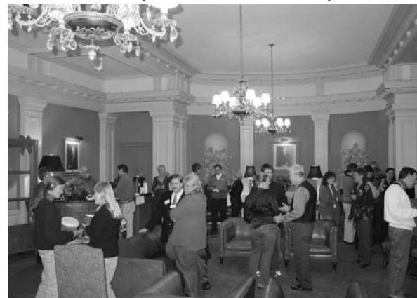
Chickasaw Group members and friends enjoying each other's company.