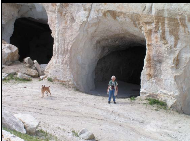
Mine on the Death Valley Trip