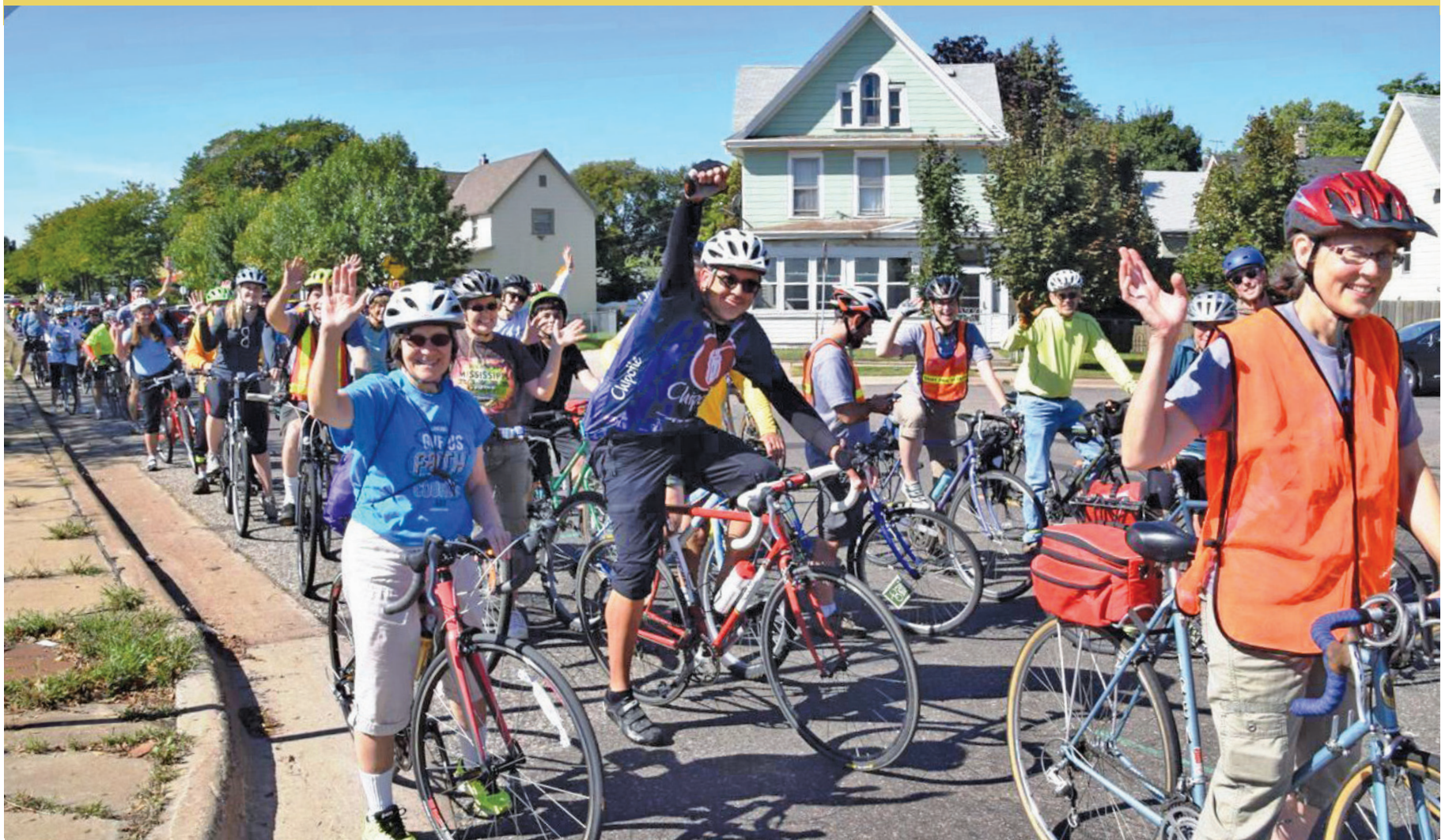
2015 Bike Tour

Each fall, the Sierra Club organizes a bike ride like no other! This fun, leisurely tour highlights growth, development and transportation infrastructure in the Twin Cities. Each year we visit a different location, combining a scenic bike ride with guest speakers at educational rest stops along the way.