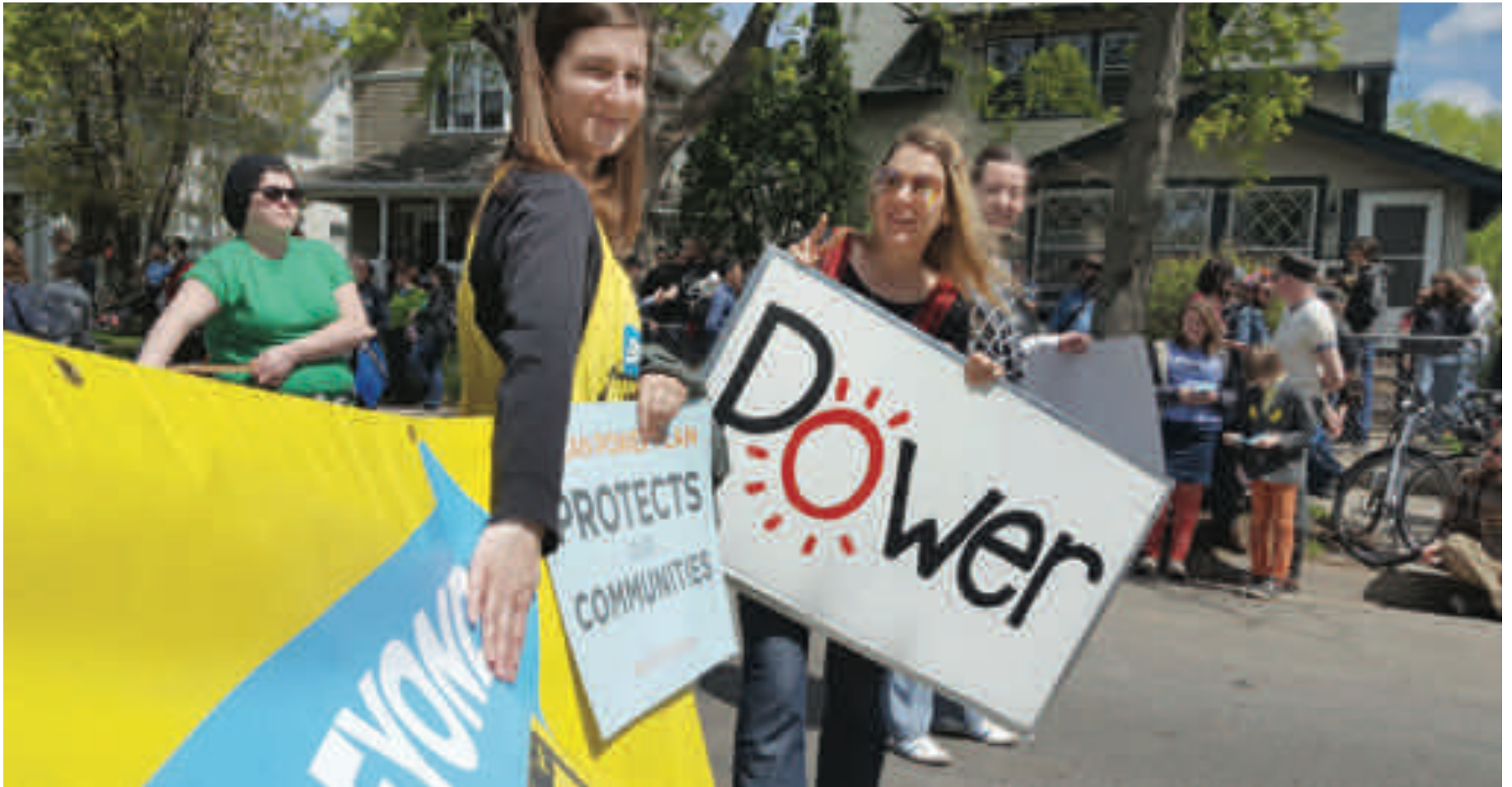
Clean Air and Renewable Energy at May Day Parade