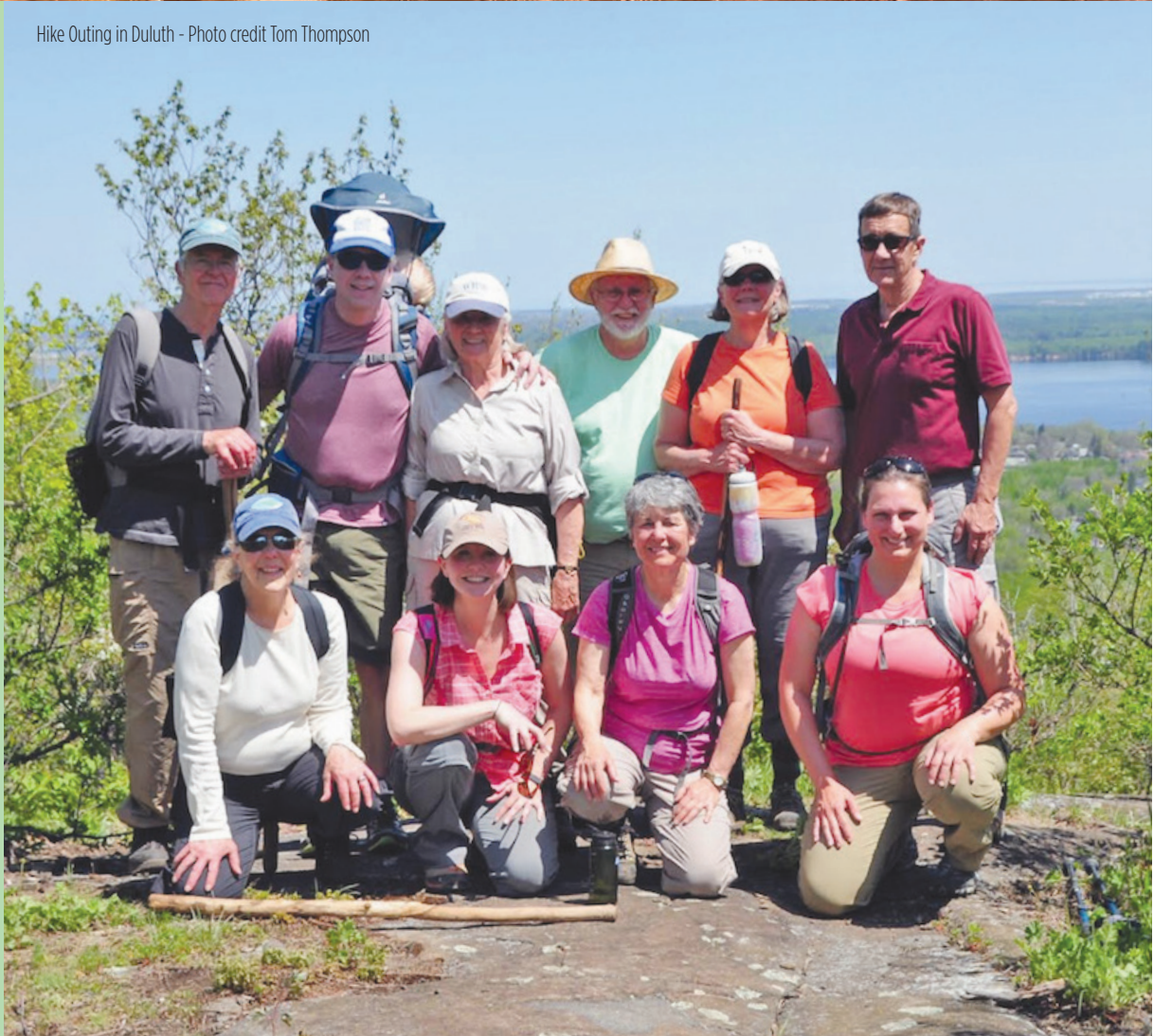
Hike Outing in Duluth