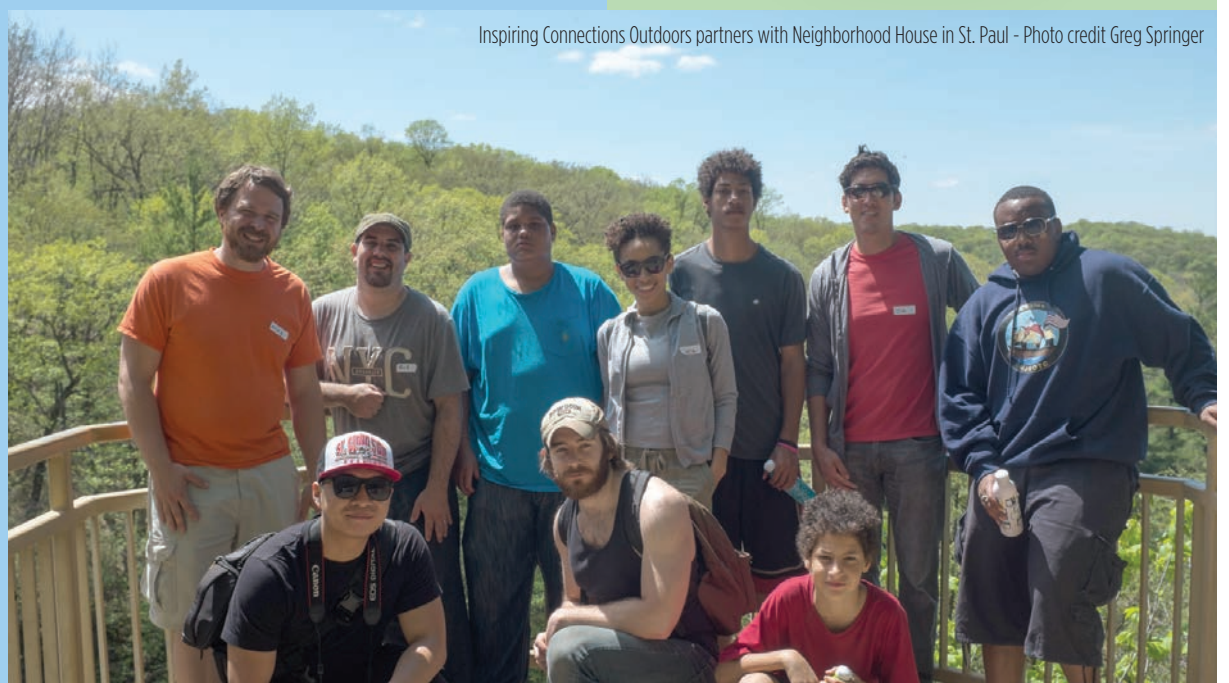
Inspiring Connections Outdoors partners with Neighborhood House in St. Paul

To learn more, visit us at www.sierraclub.org/minnesota/inspiring-connections-outdoors . To get involved, contact us via email at mnico@northstar.sierraclub.org .