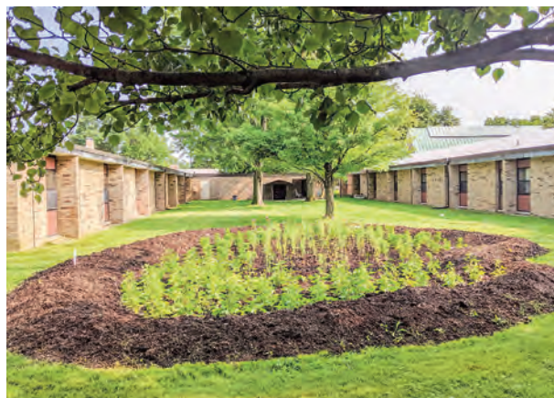
St. Paul rain garden

Now in its sixth year, the Rain Gardens to the Rescue program is a partnership between the Chapter's Detroit-based Great Lakes Great Communities campaign and FOTR. We have installed 70 rain gardens at homes and faith-based organizations throughout the city that treat up to 47,000 gallons of rainwater per rain event. We've engaged over 600 people and provided training to 100 Detroit residents on the design and installation of rain gardens along with the benefits of GSI.