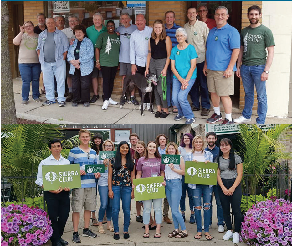
Top: The Hard Working 2018 Michigan Sierra Club Political Committee Bottom: The 2018 Michigan Sierra Club Political Interns