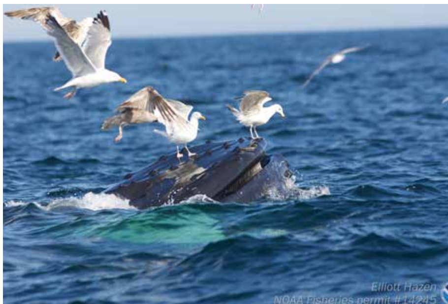
Elliott Hazen NOAA Fisheries permit # 123245 NOAA Photograph by Elliot Hazen