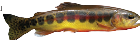
California Golden Trout

Website: www.sierrawild.gov/wilderness/domeland