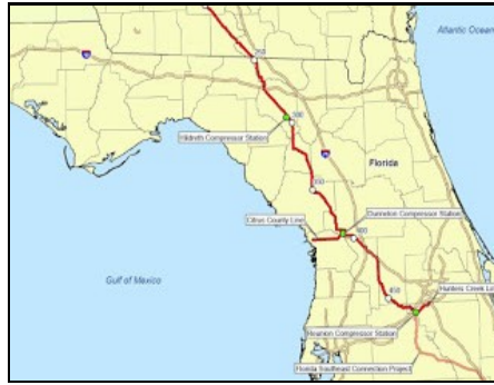
Proposed route of pipeline in Florida