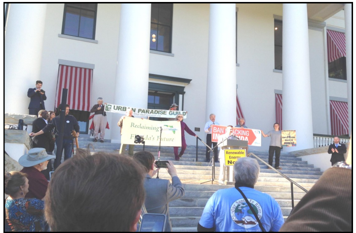
Protestors gathered at the State Capitol on January 20 to urge legislators to oppose bills that would allow fracking and support Obama's Clean Power Plan.

Before a vote was called in his committee, Lee demanded an accounting by FDEP on the science behind the fracking process, which involves the injection of mass quantities of water along with unknown chemicals and sand under immense pressure to fracture underground rock formations —