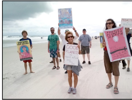
Sierra members on Daytona Beach

One of our recent accomplishments was to succeed in eliminating dog hunting in the Deep Creek Preserve. Along with the Audubon Society and Native