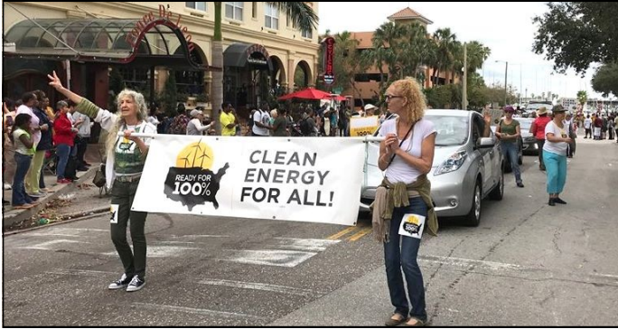
Suncoast Sierra members, accompanied by four electric vehicles, marched in the Dr. Martin Luther King Jr. Parade on Jan. 16 in downtown St. Petersburg. After the parade, the group exhibited at a Family Fun Day.