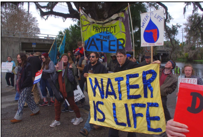
In "Walk for Water, Speak for Springs" on January 28, water protectors gathered in Dunnellon to oppose the construction of the Sabal Trail Pipeline

Sierra Club Florida celebrated the closing of another coal-fired power plant. Florida Power & Light Company (FPL) retired the Cedar Bay Generating Plant, a 250-megawatt coal-fired facility located in Jacksonville. We are also celebrating the defeat of the ROGG (River of Grass Greenway), a paved hike and bike trail from Naples to Miami that would have destroyed wetlands and crossed sacred Native American lands.