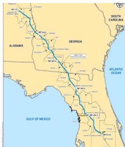
Sabal Trail Pipeline extends through Florida, Georgia and Alabama. The final segment in Florida is nearly finished.

Aquifer. The Army Corp denied the request. The horizontal boring that they are doing under the rivers has caused sinkholes and inadvertent releases of drilling mud; more problems are expected.