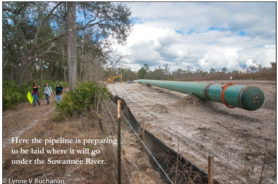
Here the pipeline is preparing to be laid where it will go under the Suwannee River.

The Sierra Club, along with other groups, requested that the Army Corps of Engineers do an Environmental Impact Study as the construction will significantly impact the fragile karst terrain, springs and the Floridan