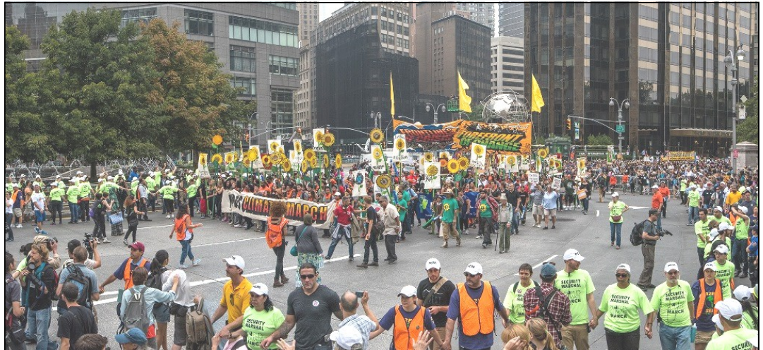
Some 400,000 marched in 2014 in the People's Climate March in New York City. On April 29, marches will take place in Washington D.C. and cities across the country.