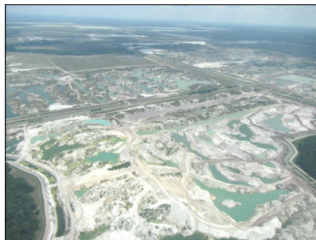
Phosphate mining in Polk County

■ In January, a formal statement was submitted to Manatee BOCC opposing Mosaic's request to approve its Master Mining Plan and rezone 3,596 acres of their Wingate East property for phosphate mining citing destruction of wetlands and the threat of