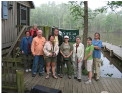
Delta Chapter 2012 Retreat