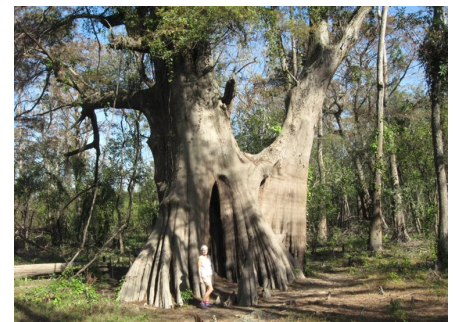
Top: Trees are measured and tagged. Bottom: Largest Bald Cypress in US is in W. Feliciana Parish - 85 ft. tall, 54 ft. circumference

But in Louisiana, Skrmetta — in power for another six years — will likely hang on to dying industries and polluting energy. We don't just shoot ourselves in the foot; we aim for the head.