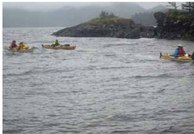
Prince William Sound's dramatic land and seascapes are popular for kayak trips near remote inlets and islands.

Yet, despite its remarkable value, the area lacks enduring protections. Since 1980, two million acres of western Prince William Sound has been stuck in an interim "Wilderness Study Area" status, a murky classification with few defined standards. It remains open to mining potential and habitat alteration schemes. And its growing popularity has degraded conditions, caused a sharp decline in black bear populations (see ADFG reports), and spawned growing motorized uses, including unregulated chainsaw and snow machine activities.