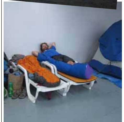
Solarium sleeping arrangement on the Kennicott

Alaskans are strongly connected to Prince William Sound. It is where generations of families have come to fish, hunt, explore, and enjoy solitude and renewal. It’s where local businesses thrive. Stay tuned for your opportunity to remind the Forest Service to protect this special place. ❖