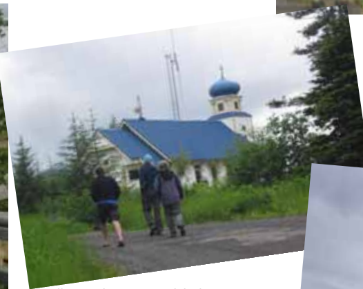
Walking in Chenega Bay, while the Kennicott stops there en route Whittier