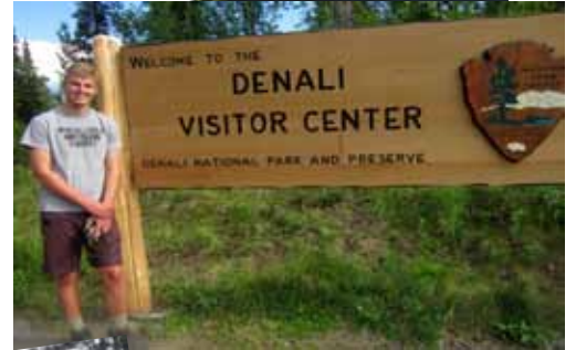
Denali in Denali National Park