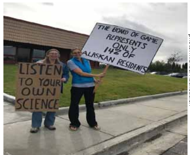
At Fairbanks protest against wolf killing