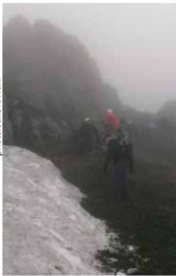
Peak Three behind Flat Top, Chugach State Park: misty