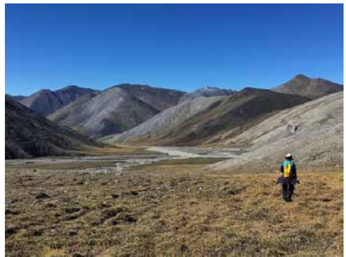
Hiking in the vast Arctic Refuge—at edge of the Coastal Plain

My notebook from Day One of an eleven-day, six-person trek through the Arctic National Wildlife Refuge includes the following scrawled notes: