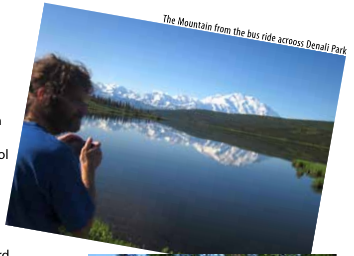
The Mountain from the bus ride across Denali Park